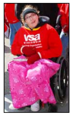
VSA Day: Signing the National Anthem; getting ready to play with the UW Marching Band

The mission of VSA Wisconsin is to expand the capabilities, confidence and quality of life for children and adults with disabilities by providing programs in dance, drama, creative writing, music and visual art.