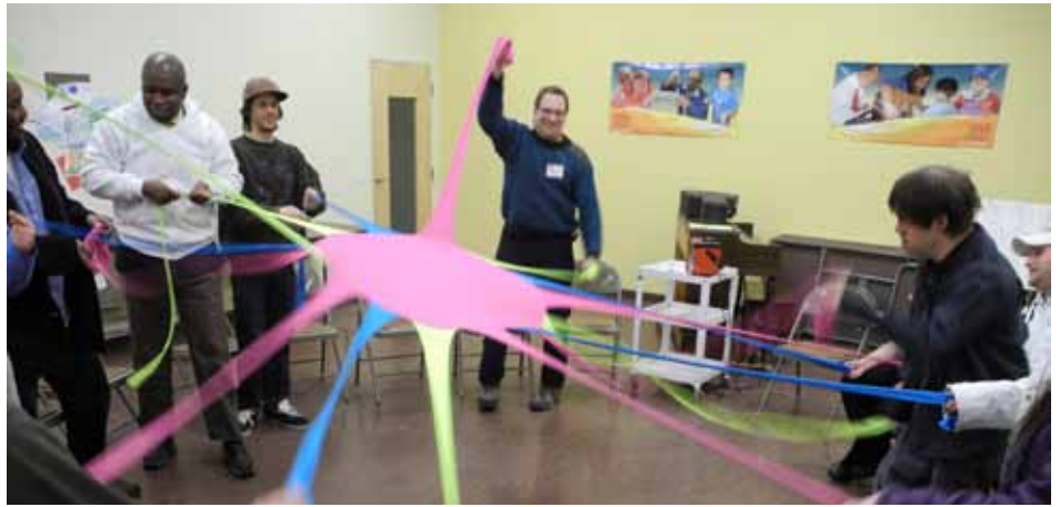
Participants enjoy a movement class at the VSA Art Center

To receive this newsletter in an alternative format, contact VSA Wisconsin.