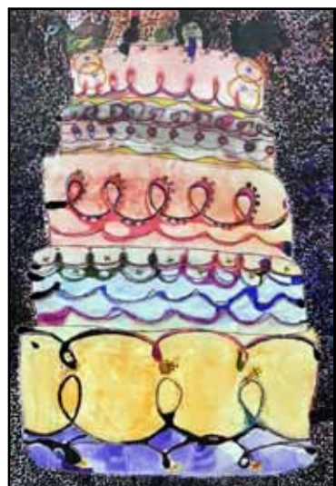
Dream Wedding Cake by Kristiana Shiko

Sophisticated, whimsical, exotic, and dramatic are just a few words that describe the exquisitely expressive works that were submitted to VSA Wisconsin's 2012 Call for Art. More than 240 artists submitted 357 two- and three-dimensional works and the resulting Visual Expressions exhibition was a kaleidoscope of color, shapes and themes. All works were on view at the VSA Wisconsin Gallery in Madison from March 17